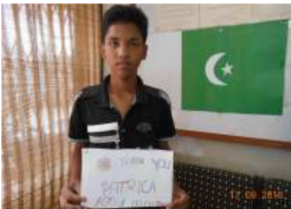
Thanking his sponsor