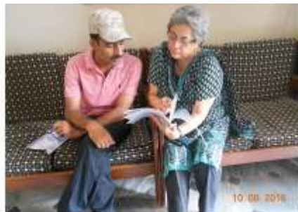
Applying for his child's sponsorship Save One Life