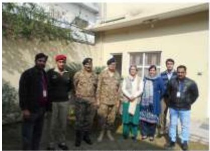
AFIP's Team Visit