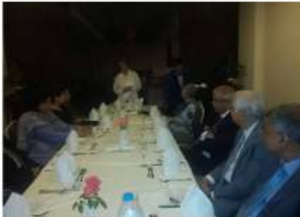
Board of Governors Meetings