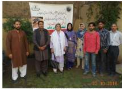
Dengue Awareness Seminars