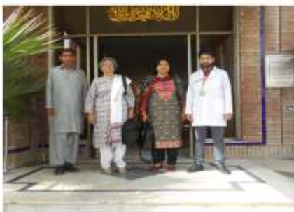
Hilal-E-Ahmer Hospital, Faisalabad