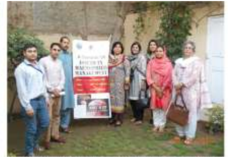
Issues in Haemophilia Management