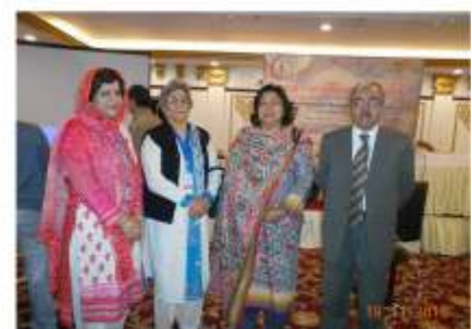
International Surgical Conference