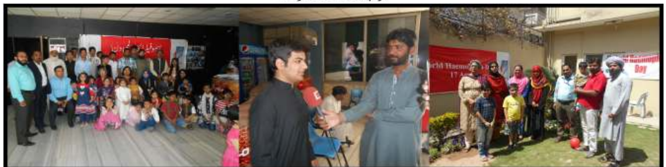
World Haemophilia Day