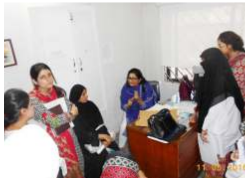
Continued Medical Education (CME) sessions were held with trainees from PIMS Hospital.