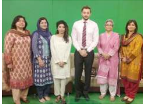
PHPWS Team was invited to speak on PTV live television in regards to World Haemophilia Day.