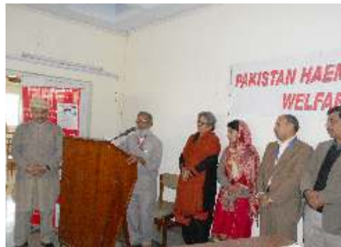
Elections for Executive Board Office bearers was held in December 2015. General body members consisting of registered persons with Haemophilia and volunteers came together to vote for the new Executive Committee.