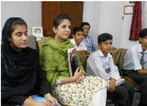
A computer training was organized for some patients. After successful completion of this course, the patients received their participation certificates from PHPWS Managing Committee Members.