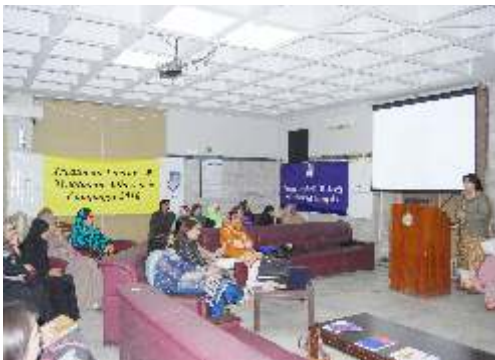
Two Seminars on Treatment, Literacy and Adherence Campaign sponsored by Novo Nordisc National Haemophilia Foundation (NNHF) were organized by PHPWS Rwp/Isb Chapter.