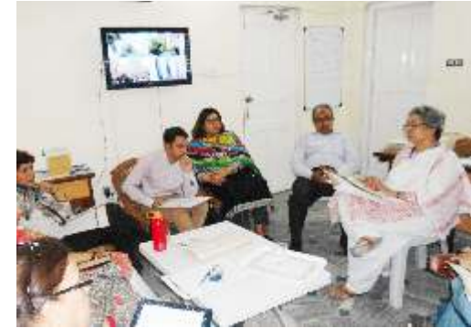
Monthly meetings are held with Executive Board Members in which a monthly action plan is discussed and responsibilities assigned.