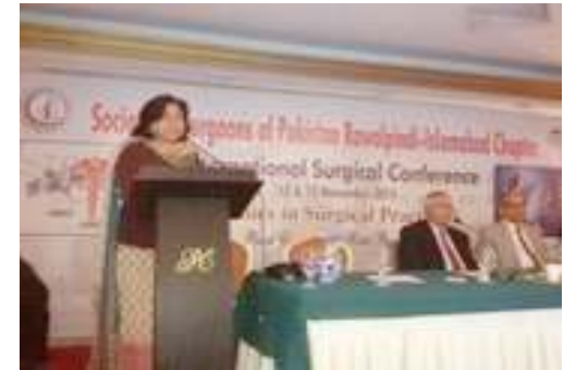
PHPWS was invited to partake and speak on "Guidelines for Surgery in Patients with Acquired Bleeding Disorders in Pakistan" at the concluding Ceremony of the International Surgical Conference hosted by the Society of Surgeons of Pakistan, Rwp.